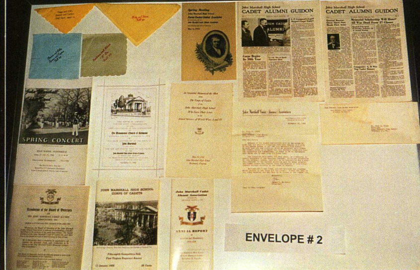
ENVELOPE # 2