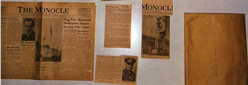
ENVELOPE # 2