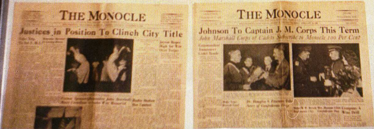
ENVELOPE # 1